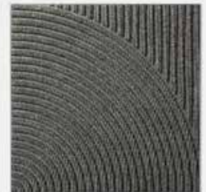
VC Vertical & Circular