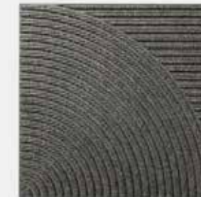
HC Horizontal & Circular