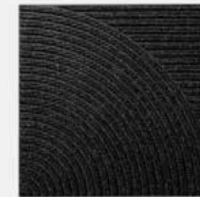
HC Horizontal & Circular