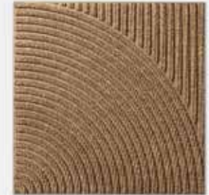
VC Vertical & Circular