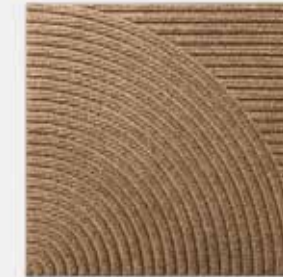
HC Horizontal & Circular