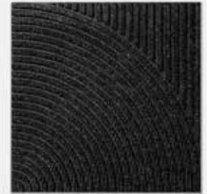
VC Vertical & Circular